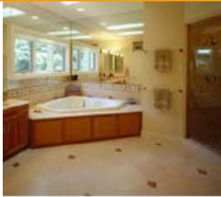
Custom Home McLean, VA

Each month, BOWA Home Advisor provides you with important tips on how to improve and protect your home's value. We hope the following is helpful.