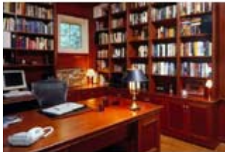
Custom Home McLean, VA

Each month, BOWA Home Advisor provides you with important tips on how to improve and protect your home's value. We hope the following is helpful.