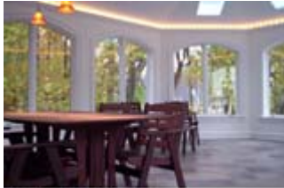
Custom Porch Great Falls, Virginia

Each month, BOWA Home Advisor provides you with important tips on how to improve and protect your home's value. We hope the following is helpful.