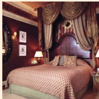
Just one of the 15 luxurious guest rooms in which you can stay at the award-winning The Inn at Little Washington — our treat!