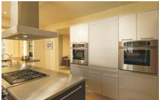
Complementing both traditional and contemporary styles, stainless has stood the test of time to become the new "classic."

The result is a trend toward a more livable kitchen with a fresh take on chic casualness and sophisticated comfort. The new kitchen incorporates the design strategies and philosophies previously reserved for the rest of the home. From eclectic material choices to specialty lighting and non-dining furniture, homeowners are creating kitchens that are inviting, practical and personal. BOWA Builders is seeing this design evolution in its share of the nearly $15 billion kitchen addition and renovation market, as well as in their custom home projects.