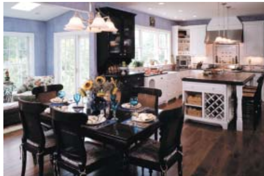
Antiques, upholstered chairs and furniture details on the island and cabinetry create a warm, inviting space for family and friends.

In recent years, we have seen kitchens grow larger and more versatile and even expand into other portions of the