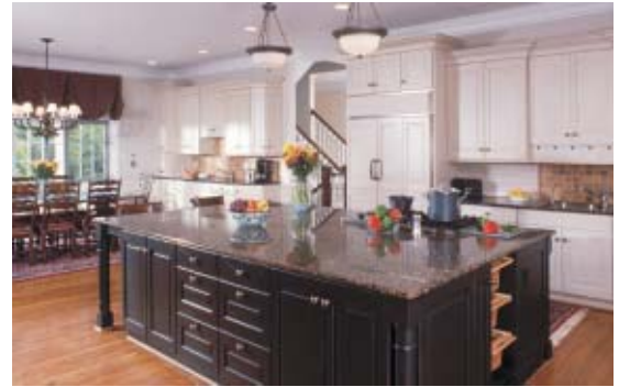
Specialty lighting, mixed surfaces and varied counter heights help to create special-use areas in today's versatile kitchen.

With respect to the kitchens they are designing, 41% of survey respondents indicated the size of kitchens is on the rise. To serve the multiple demands on today's kitchens, designers are using furniture, fixtures and lighting to carve out specialty areas in the large, open spaces. These expanded kitchens may include areas suited to formal and casual dining, doing homework, high-