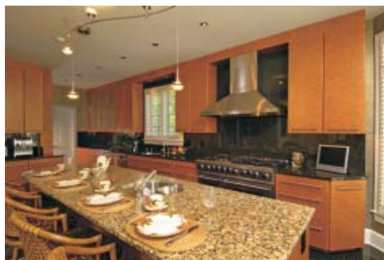
Plumbed coffee makers, wine refrigerators, pizza ovens and flat-screen TVs add to the kitchen's functionality and personalization.

Countertop materials have also evolved in recent years. Homeowners are more often opting for the aesthetic qualities and design flexibility of natural materials in a variety of finishes in lieu of the once popular solid-surface counters.