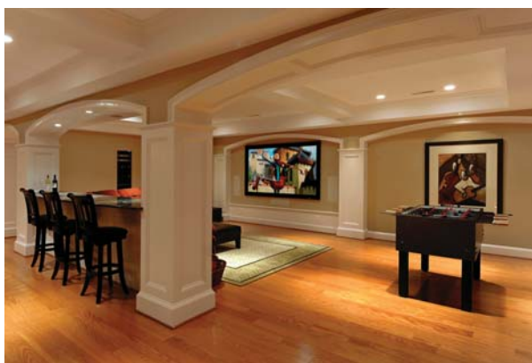
Creating spaces your family can enjoy, adds immediate value and is appealing to future buyers.

I’m not an economist (though I did stay at a Holiday Inn Express) and I haven’t analyzed hundreds of charts and tables, but I do have plenty of anecdotal evidence to the contrary. Our clients who are renovating now are extremely pleased with the timing of their decisions to invest money on their homes for many reasons. To name just a few, we are able to find them better subcontractor pricing. We can shorten their project duration. They get more attention at showrooms. And, they see shorter turnaround times on custom items. So, pundits can talk all the theory they want, but in the real world where we put hammer to nail and dollars to budgets the fact is a remodel or renovation can be designed and built less expensively and completed more quickly than just a few years ago.