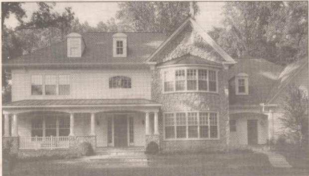
BOWA also earned an Award of Merit for this customized single family home.