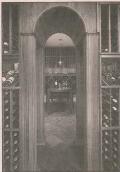
WELL-STOCKED: The custom wine cellar is a delight for the owners of this Great Falls house that was redone by BOWA Builders.

No doubt the project's string of plaudits owes something to its sheer audacity: a three-story wing encased in reflective glass that was made to look 'inevitable.'