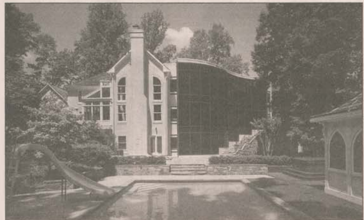
DRAMATIC CHANGE: A curved exterior wall of glass adds drama to this renovated Great Falls home.