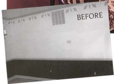
ABOVE: The owners took a wallpapered space and created a formal dining room with striking red walls that repeat the pattern of color found throughout the home. OPPOSITE PAGE: Two of Teresa Duncan's favorite areas include the foyer with fabric-draped door and the oversized Lapis Blue laundry room upstairs.