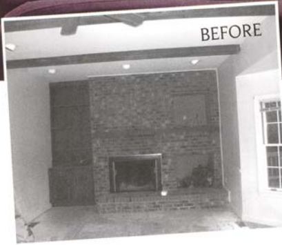
OPPOSITE PAGE AND ABOVE: By removing an awkward opening and adding a welcoming archway, the sunny family room and the linen blue morning room and kitchen are now the core of the home.