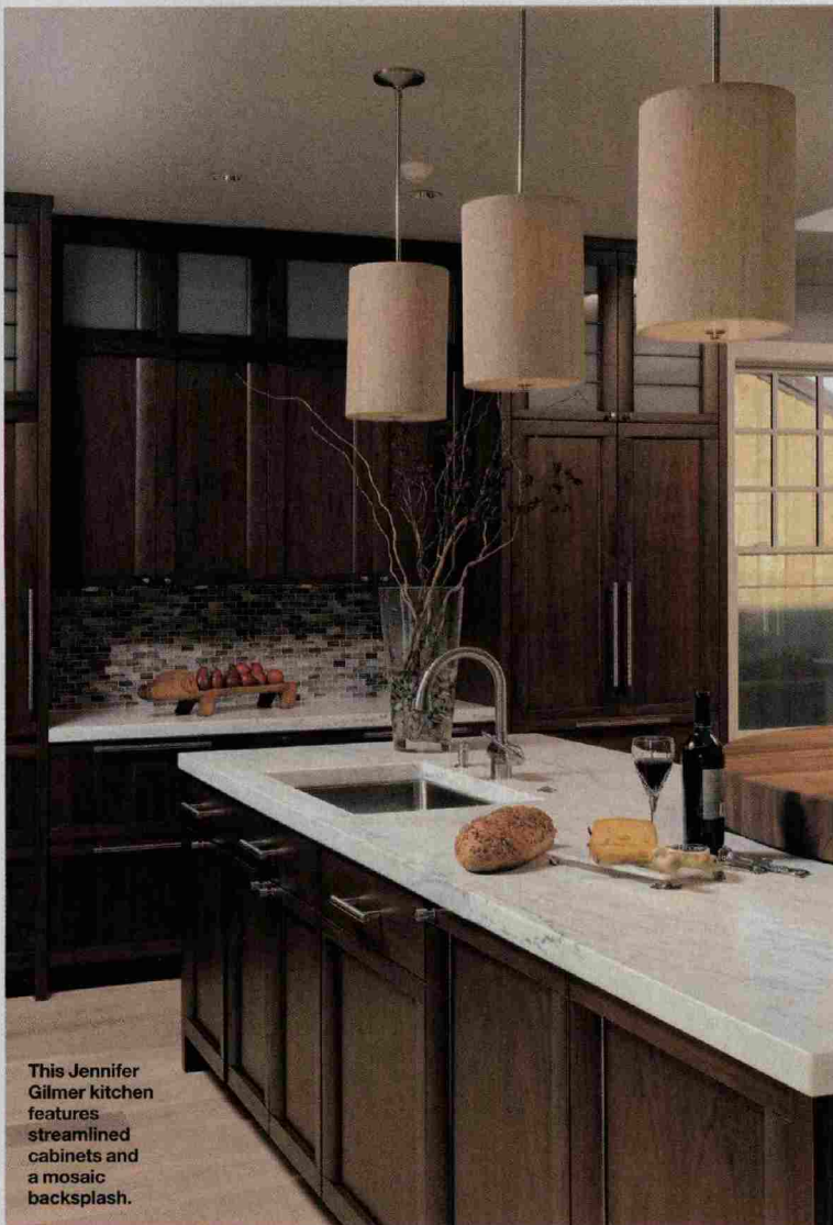
This Jennifer Gilmer kitchen features streamlined cabinets and a mosaic backsplash.

Here's what's hot for cabinets, paint colors, countertops, backsplashes, and more